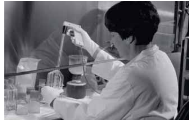
Laboratory technician handling hazardous material.

That's why NTI and the Global Health and Security Initiative have devoted considerable energy to developing regional networks that strengthen rapid detection, investigation and communication and enable an early and effective response. In two critical regions—the Middle East and Southeast Asia—NTI projects are serving as models for regional cooperation that can be replicated in other areas of the world.