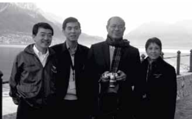
[top and center] Photos by GHSI staff during trips to assess laboratory capacity and public health infrastructure in Southeast Asia.